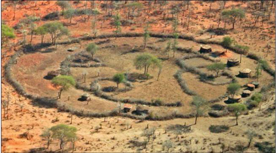
Fig. 2 Aerial view of a traditional, Maasai boma; inner, thorn ring represents the livestock enclosure