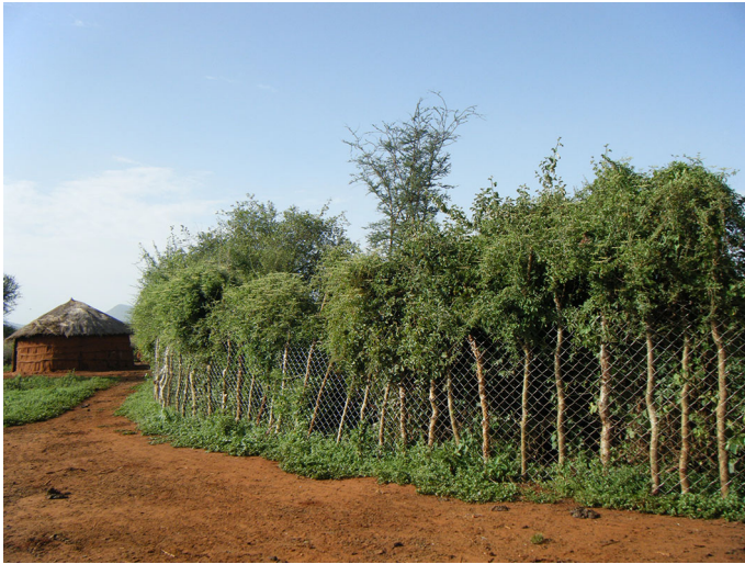
Fig. 3 A Living Wall

cattle ($450), shoats ($50) and donkeys ($200), converted at a rate of 1,550 Tanzanian Shillings to 1 US Dollar. This amounted to $19,700 in damages (assuming wounded animals died later or lost their value due to injuries). Lions were responsible for 64 % of all predator-induced financial loss or $12,550 due to their greater likelihood to kill cattle. All events took place at night except for the one jackal attack that occurred during the day. 66 % of attacks occurred during the rainy (November–April; n = 37 ) and intermediate seasons (May–June; n = 8 ), coinciding with the seasonal movement of wildlife outside of Tarangire National Park.